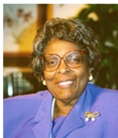
Congresswoman Cardiss Collins

Congresswoman Collins was considered a "trailblazer" throughout her political career. She was the first African-American woman to represent a Congressional District in the Midwest. Congresswoman Collins was also the first woman