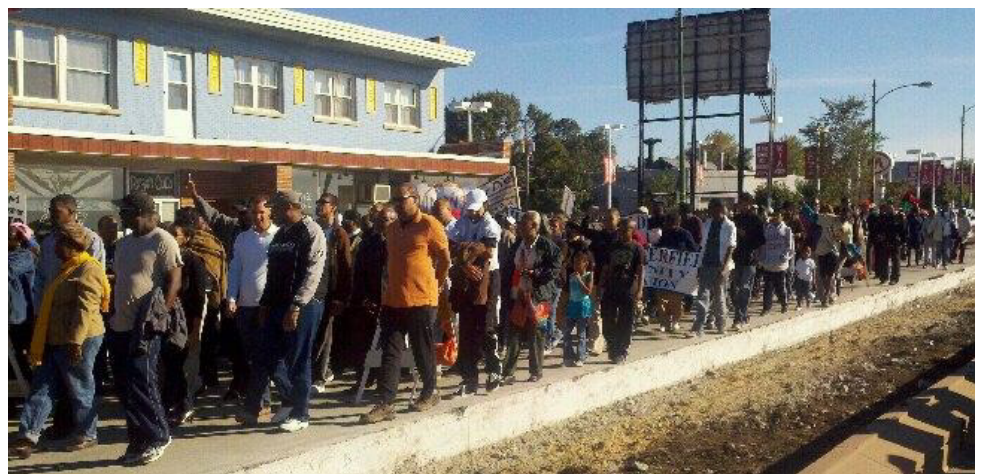
Demonstrators march peacefully on Western Avenue between 91st Street and 95th Street.