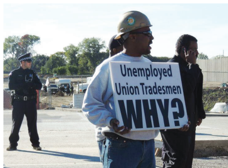
An unemployed union tradesman stands on the sidelines and salutes the demonstrators as they march by.