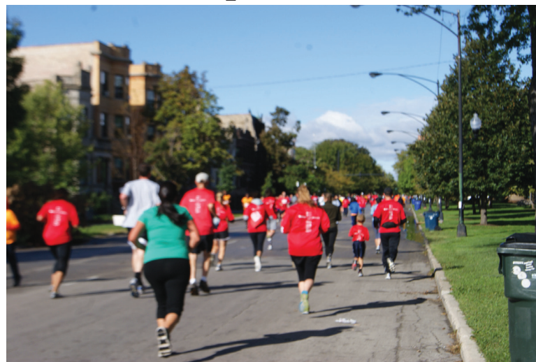
Runners returning at half way mark of 5k walk/run event located at Douglas Blvd and Albany Ave.