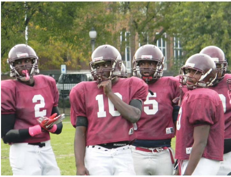
Austin plays games in their practice jerseys. They were never issued game uniforms, but they say they don't care about appearance, they just want to win.