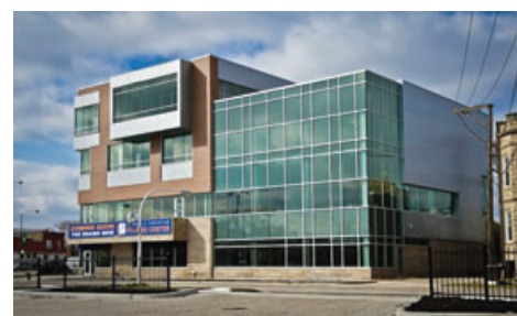
Lawndale Christian Health Center - new Health and Fitness Center

residents to take control of their health and wellness," said Mayor Emanuel. "Facilities like this one promote a high quality of life for Chicagoans right in their own neighborhoods and increase the overall economic and social vitality of our communities."