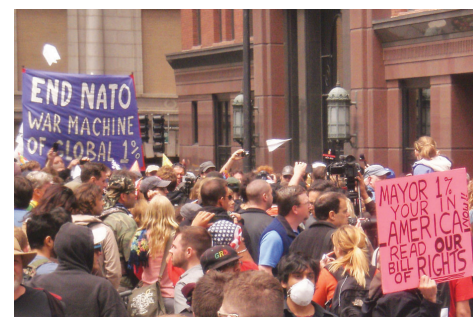
Unfriendly Skies: Paper planes dart over the heads of Occupy Chicago protesters condemning Boeing Corporation as a "war criminal" Monday.

Hailed as an opportunity to showcase Chicago as an international, cosmopolitan