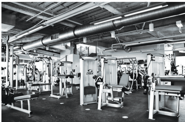
View of the fitness area in the new Health and Fitness Center at Lawndale Christian Health Center.

First-of-a-kind West Side facility marks a turning point in community-wide healthcare