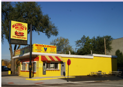
Maxwell's located at 2600 W. Ogden