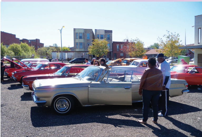
Classic Cars lined up in lot next to Maxwell's Polish on Ogden at 2600 W. Ogden Ave.

On a sunny, warm Sunday afternoon, classic car owners came to an auto show on Ogden Street to present their automobiles and socialize with other car-lovers. One by one, well polished, fine-tuned classic automobiles pulled up to the empty lot next to a recently opened Maxwell restaurant to be put on display. Each car that showed up to the event had vintage and original features that impressed many spectators.