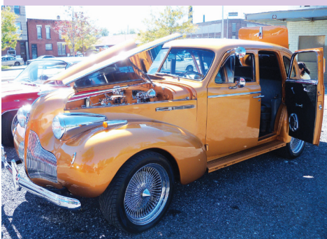
Classic car open for viewing at Maxwell's