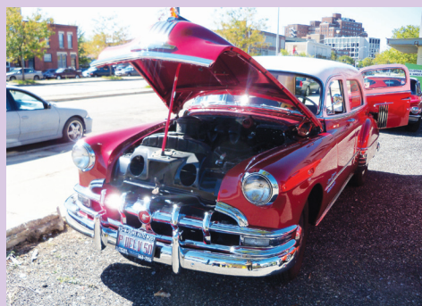
Classic car, red 1950 Pontiac