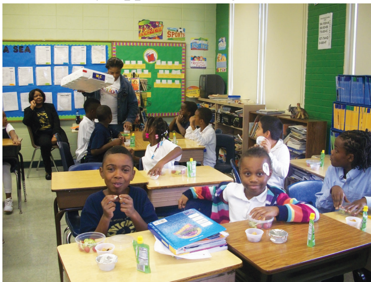
King elementary students "Get in the Action"

Some 60 volunteers, made up of parents, educators and community leaders, lent their time and muscle Tuesday to teach students at Ashburn Community Elementary about the importance of eating healthy food and to increase their opportunities for physical activity. It was all part of the Action for Healthy Kids national service initiative, Get in the Action