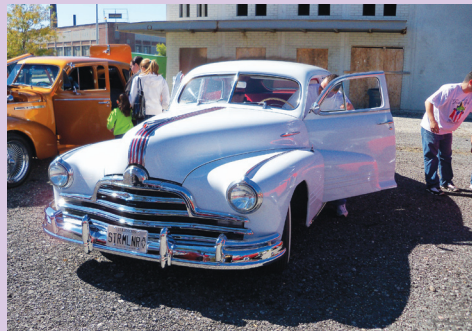
Observers looking at Classic cars