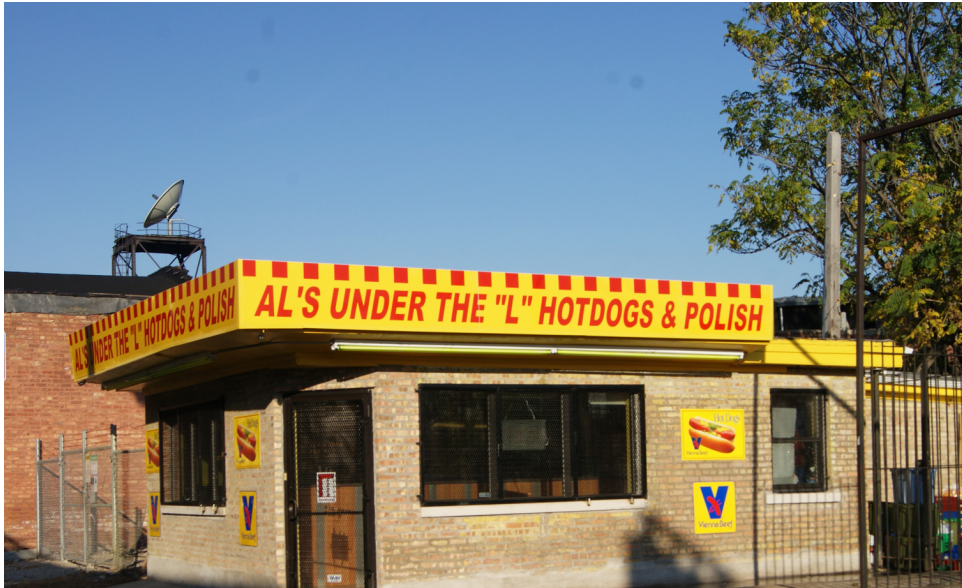
Al's Under the "L" located at 2908 W. Lake Street