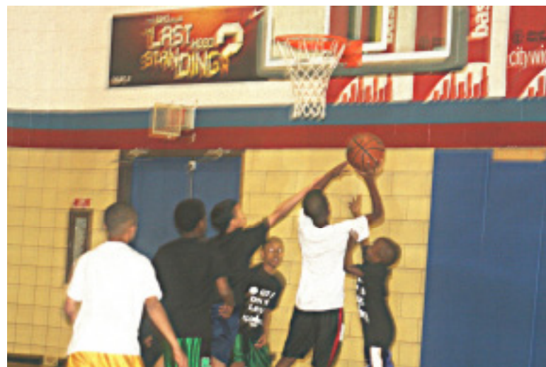
"Get on My level" all-star basketball youth at Franklin Park for their all-star game.

Get On My Level is not just a basketball organization but it is an