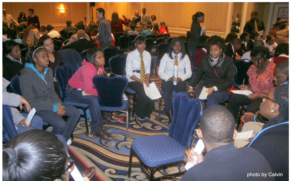
Students in the House discuss which way the Curfew Ordinance should be modified.pdf

A geographic cross section of Chicago Public School students, took part in the 35th Annual Legislative Conference, held in Chicago Dec. 7-11, 2011, at the Renaissance Chicago Downtown Hotel. There was a "MOCK SENATE SESSION" held with topics like A longer School Day- How would it effect