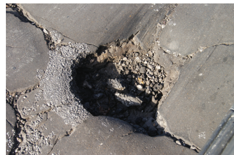
Photo taken of street pothole around Melody Elementary School located at 412 S. Keeler photo taken on wednesday December 7, 2011