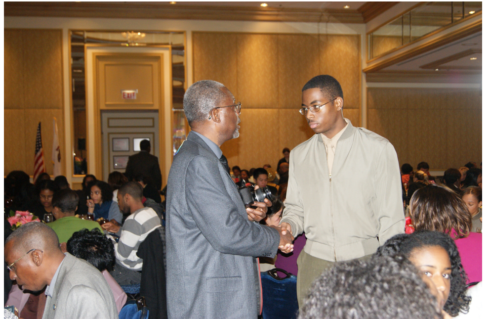
NLCN photographer greets Marine Science and Math Academy student during youth luncheon of the National Black Caucus of State Legislators