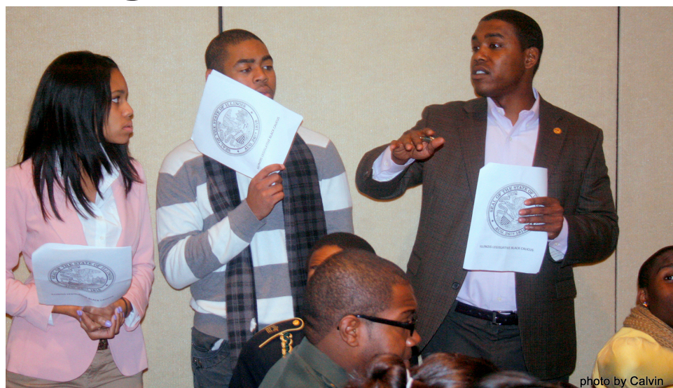
State Rep. Art Turner Jr (IL) (9th District) making the rules clear to youth in when it comes to the Bullying ordinance

Progress." Organizers said NBCSL members would leave the conference armed with legislative ideas they can take to their respective Capitols during the upcoming legislative sessions.