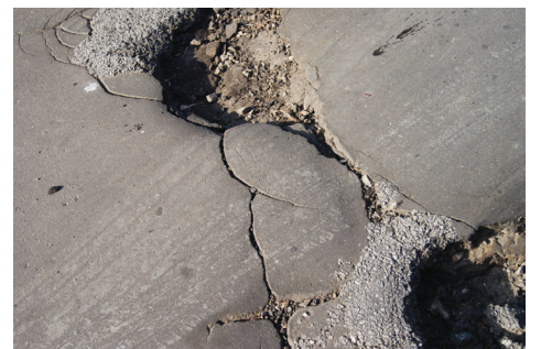
Photo taken of street pothole around Melody Elementary School located at 412 S. Keeler photo taken on wednesday December 7, 2011