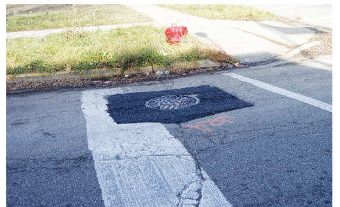
Photo taken of repaired street pothole Melody School located at 412 S. Keeler photo taken on wednesday December 7, 2011. Although some potholes were repaired others were not.