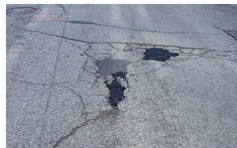
Photo taken of repaired street pothole Melody School located at 412 S. Keeler photo taken on wednesday December 7, 2011. Although some potholes were repaired others were not.