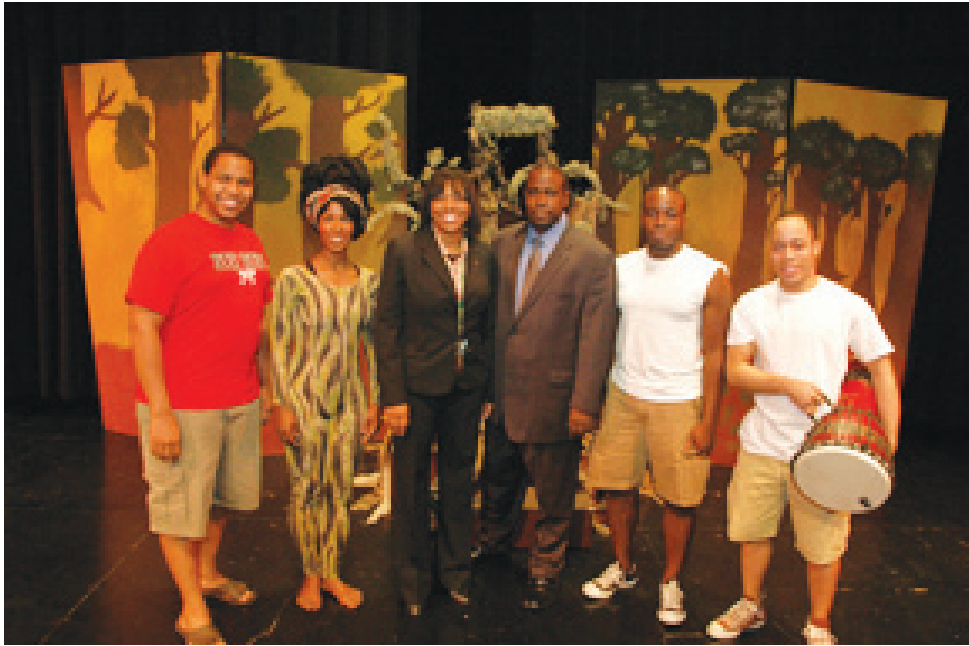
Cast members of the play

On Thursday, December 8, an audience of adults and teenagers watched young, African-American actors as they performed a play at Westinghouse College Prep. Based on an old African folk tale, the play was called "The Tree That Grew Human."