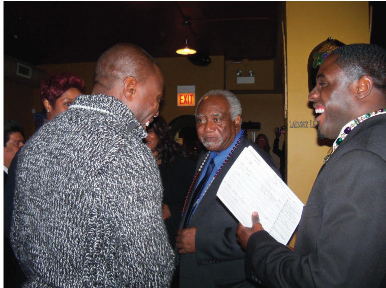
Congressman Danny K. Davis with some of the young professionals

Young professionals all throughout the city of Chicago came together last Saturday evening to salute Congressman Danny Davis. Amongst the young