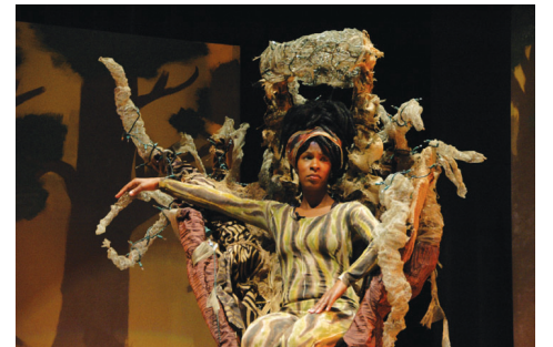
The special tree "Malika"

He feels that the lesson that the play teaches is relevant to today. He explained that the economic crisis that America is currently facing is caused by greedy people