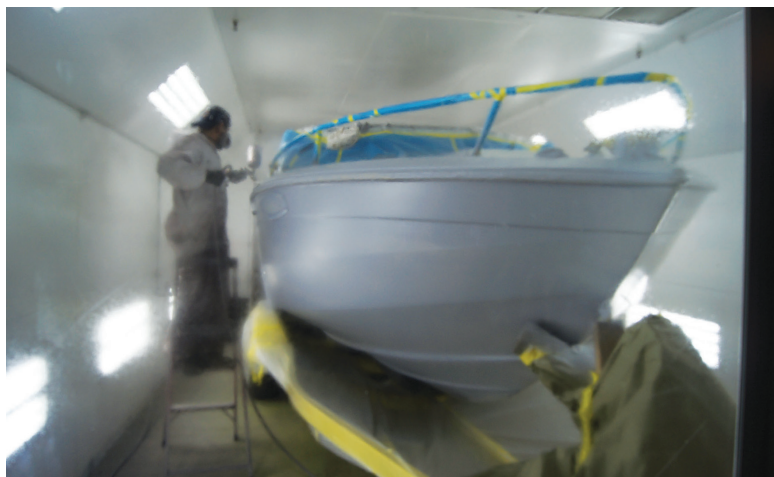
Maaco not only paints cars but a variety of different vehickes including boats.