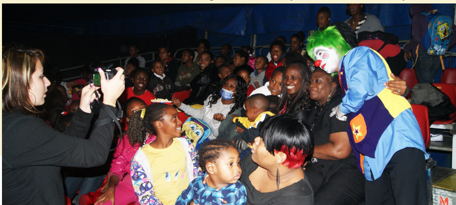
Pre-show clown taking photos with youth and parent chaparones at UniverSoul Circus