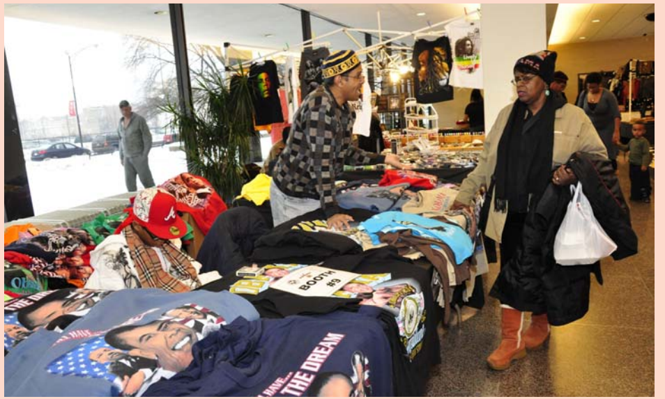
The African Marketplace vendors selling their products in the Malcolm X College lobby

program began at 12:00 pm everyday, except Sunday (2:00 pm). The College collaborated with the Council of Elders as a link between the past and the present. They are also the guardians of the culture, traditions and history of the African people. Some of the entertainment included the Najwa Dance