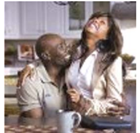
Morris Chestnut and Taraji P. Henson in Not Easily Broken

NOT EASILY BROKEN (**1/2) "Not Easily Broken" is an urban domestic drama derived from a T. D. Jakes book that involves the personal and religious instability of a crumbling married couple. David Johnson (Morris Chestnut) is struggling to establish a business as a business contractor. He seems preoccupied with his homeboys, Brock and Tree (Eddie Cibrian and Kevin Hart), shooting hoops and coaching a little league team.