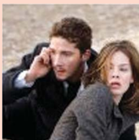
Shia LaBeouf and Michelle Monaghan in Eagle Eye