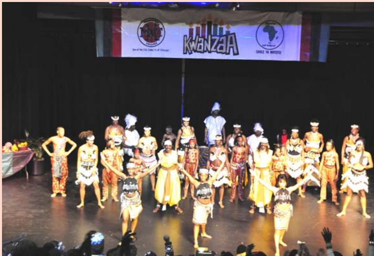
The Najwa Dance Corp performed African Dance numbers at the 2008-2009 Kwanzaa celebration. Every year NDC brings african culture through dance.