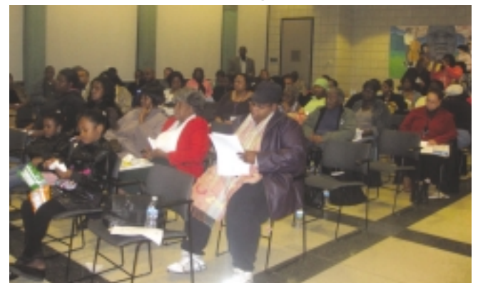
A full Audience attended as three nonprofits received recognition for their participation North Lawndale Non-Profit Organizational Capacity Building Initiative.