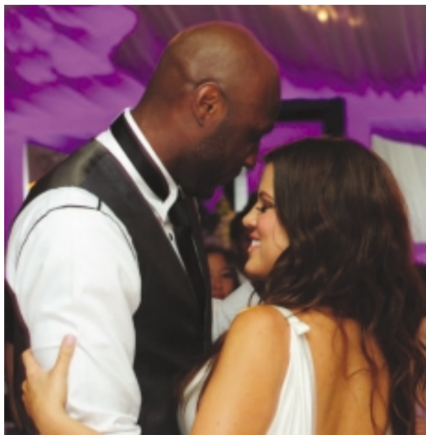
Lamar Odom and Khloe Kardashian after they tied the knot.