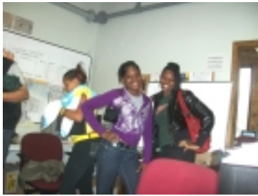
Pathfinder youth pose while visiting the North Lawndale Community News

and Rhetoric as students also had to speak to the audience of family, staff, friends and strangers.