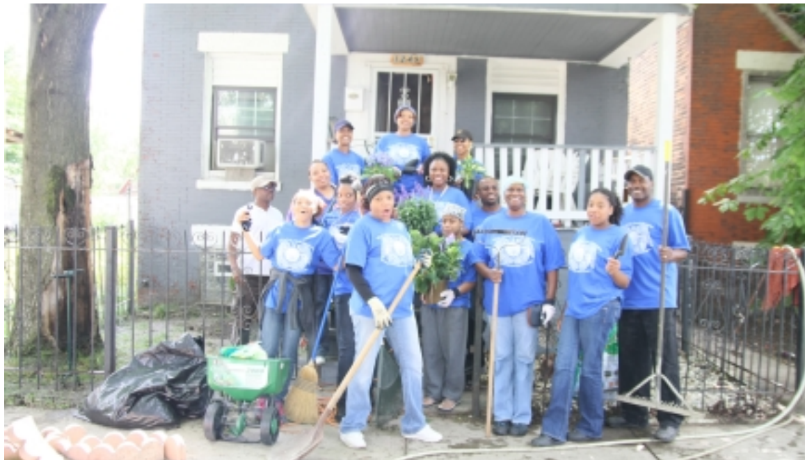
Work of his hands ministry members posed for photo during beautification and cleanup between church and community.

The blessed recipients of the outdoor makeovers were grateful and extremely appreciative. One of the recipients stated he was losing faith in the church because he felt the church did not keep their word (consistent