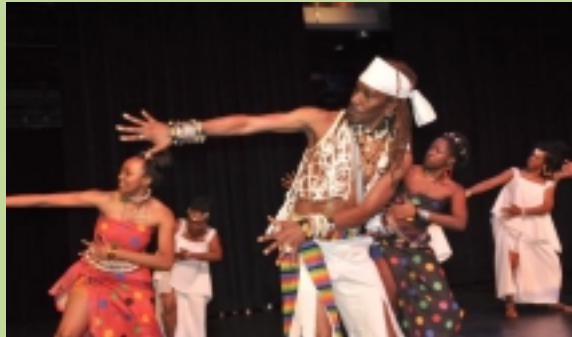
The Najwa Dancers give audience a taste of African culture