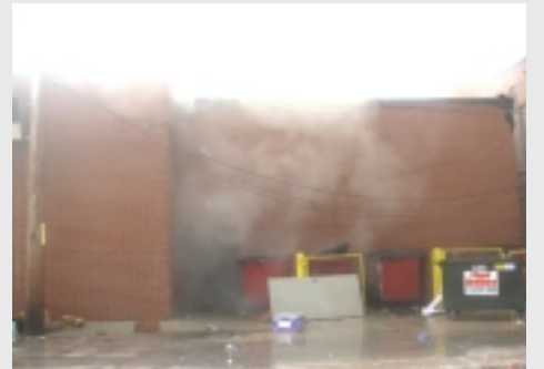
Smoke coming out of the Super Dollar & Up Store. The store was noted for having helium tanks for balloons inside, possibly prohibiting firemen for safety reasons from going inside, along with a weakened roof.

between 21 st place and Cermak Ave. Buses were also rerouted.