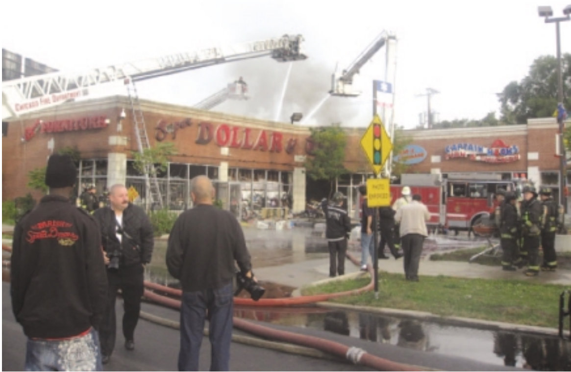
Firefighters shot water cannons on top of the roof the Super Dollar & Up store. The store was packed with merchandise. The fire initiated in Super Dollar and caused the damage of water, and window breakage for safety, to spread to adjoining businesses.

Arson is suspected as the cause of a three alarm fire that totally damaged the Super Dollar & Up, located in the Cermak Plaza located 3932-3956 W. Cermak Ave between Pulaski and Harding Ave.