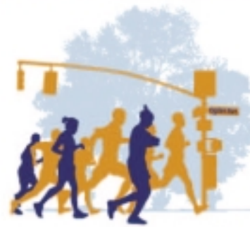
presented by Lawndale Christian Fitness Center