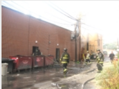
Firefighters in alley behind Cermak Plaza take firehoses inside stores to put out any smoldering fires.