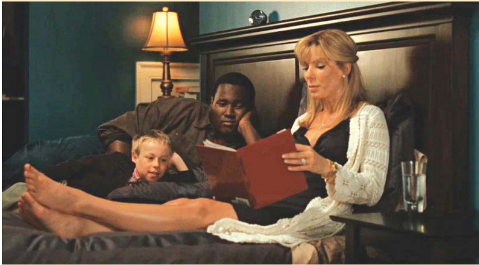
Jae Head, Sandra Bullock, and Quinton Aaron in The Blind Side

THE BLIND SIDE (**1/2) "The Blind Side" is another movie about hope over adversity that is more of a Hollywood treatment without the inner city grim and grit. Clearly, this movie is different yet familiar with its football backdrop. It is not as raw and dark as "Precious". But