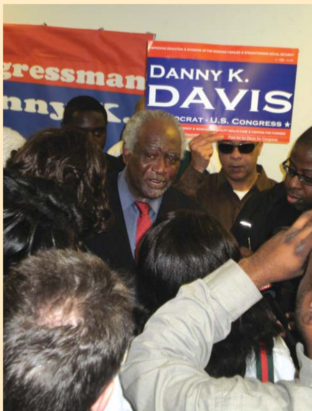
Danny K. Davis during the press conference

Cook County Clerk of Court Dorothy Brown and Chicago Ald. Toni Preckwinkle (D-4th) are also vying against Stroger on the 2010 ballot.