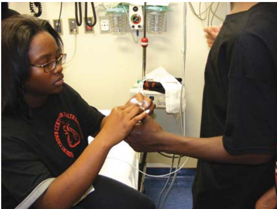
A Robert Crown Center for Health Education student in the Body Trek program attempts to place a pulse test on a fellow student during their visit at John H. Stroger Jr. Hospital of Cook County.

The Robert Crown Center for Health Education at Homan Square took its summer Body Trek science students to John H. Stroger Hospital of Cook County's Emergency Department on June 18 to experience the rigorous routines of emergency room physicians and nurses.