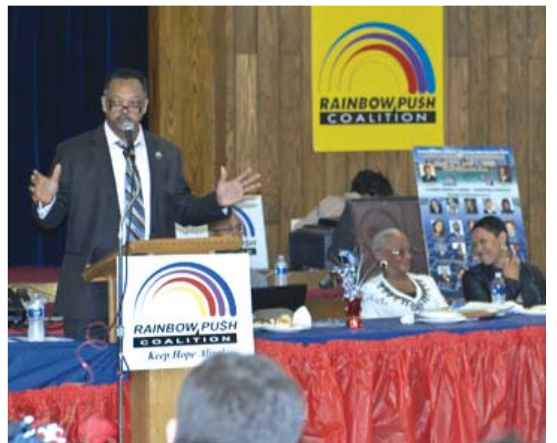
Jesse Jackson speaks on bringing the stimulus to the people