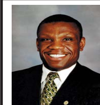
State Rep Art

Springfield Office: 300 Capitol Building Springfield, IL 62706 (217) 782-8116 (217) 782-0888 FAX