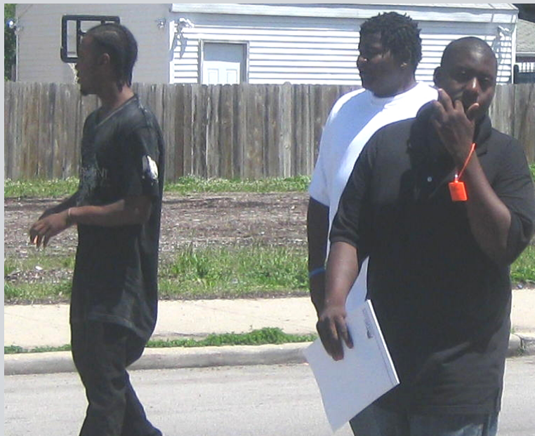
Three young men who came to find out about summer employment attended the Lawndale Reinvestment Initiative and were informed the Chicago Youth Ready summer jobs program deadline was extended beyond June 19 to July 6th.

The NSP is a nationwide program rolled out by the Obama Administration targeted to stabilize neighborhoods devastated by the effects of the sub-prime loan