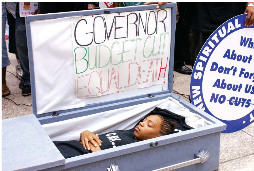
"GOVERNOR, BUDGET CUTS EQUAL DEATH" is the message on the coffin brought to the press conference by youth from the Greater Roseland Community Committee (GRCC). One of the programs that is in jeopardy is GRCC's Youth Voices Against Violence, a group of young people who are working to find nonviolent alternatives for youth and families in the Roseland community.

shootings, and there are concerns that the gun violence is going to escalate now that school is out for the summer. We are jeopardizing the future—not only of our youth, but of Illinois. One of the youth leaders who spoke during our annual Youth Democracy Day in Springfield on May 28th, summarized this well when she said, 'When we are given enough resources, we young people can strengthen our communities. But now the government wants to cut the very programs that help us become the future.'"